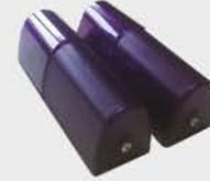
MF FOTOSEL MF PHOTOCCELL