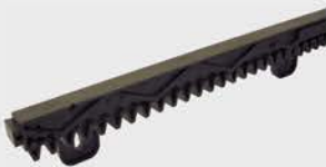
PLASTİK KRAMAYER DİŞLİ (ROA6) PLACTIC RACK (ROA6)