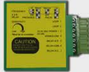
LOOP DEDEKTÖR 1 KANAL LOOP DEDECTOR 1 Chn.