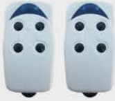
TR4 / F FİX KOD KUMANDA (4 KANAL) TR4 / F FIX CODE REMOTE CONTROL (4 Chn.)