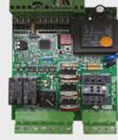
I380 KONTROL KARTI (380V) I380 CONTROL CARD (380V)