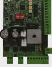
G24 KONTROL KARTI (24V) G24 CONTROL CARD (24V)