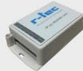
RF433 FİX KOD HARİCİ ALICI (230- 24 V) RF433 FIX CODE EXTERNAL RECEIVER (230-24 V)