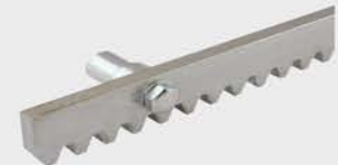
ÇELİK KRAMAYER DİŞLİ (ROA 10-12) STEEL RACK (ROA 10-12)