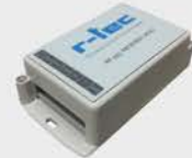
RF433 ROLLING KOD HARİCİ ALICI (230- 24 V) RF433 ROLLING CODE EXTERNAL RECEIVER (230-24 V)