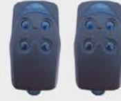
TR4 ROLLING KOD KUMANDA (4 KANAL) TR4 ROLLING CODE REMOTE CONTROL (4 Chn.)