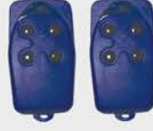
TR4 / F FİX KOD KUMANDA (4 KANAL) TR4 / F FIX CODE REMOTE CONTROL (4 Chn.)