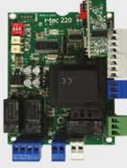
r-tec 220 KONTROL KARTI (220V) r-tec 220 CONTROL CARD (220V)