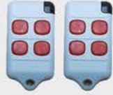
ZAR4 ROLLING KOD KUMANDA (4 KANAL) ZAR4 ROLLING CODE REMOTE CONTROL (4 Chn.)