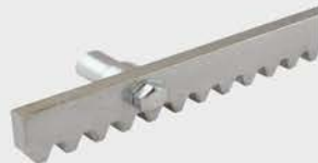
ÇELİK KRAMAYER DİŞLİ (ROA8) STEEL RACK (ROA8)