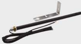
HARİCİ ANTEN EXTERNAL ANTENNA