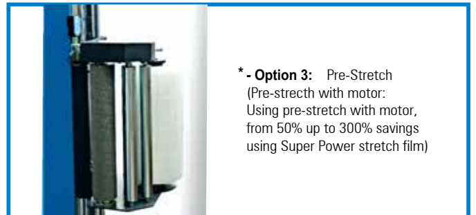
* - Option 3: Pre-Stretch (Pre-stretch with motor: Using pre-stretch with motor, from 50% up to 300% savings using Super Power stretch film)