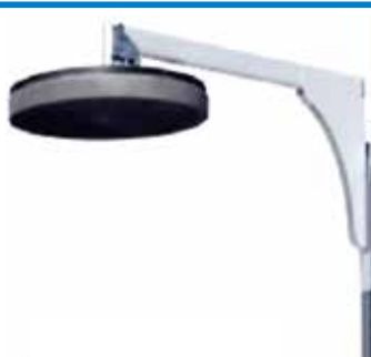
* - Option 2: Top Press (During wrapping; products that are likely to break down are fixed by pressure from the piston or motor, prevent possible damage.)