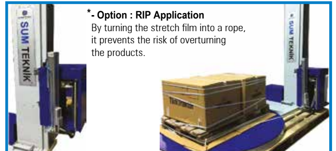
* - Option : RIP Application By turning the stretch film into a rope, it prevents the risk of overturning the products.