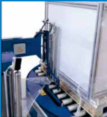
* - Option 1: Clamping and Cutting Unit: (Clamp and cuts film automatically.)