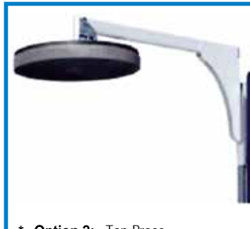
* - Option 2: Top Press (While wrapping; products that are likely to fall are fixed by pressure from the piston or motor, preventing possible damage)