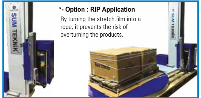
* - Option : RIP Application By turning the stretch film into a rope, it prevents the risk of overturning the products.