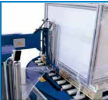
* - Option 1: Cutting Unit (Cutting film after ending wrapping)