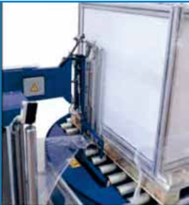
* - Option 1: Cutting Unit (Cutting film after ending wrapping)