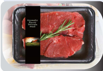
Heat Sealable Films