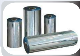
High Barrier Metalized