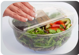
Sealable Peelable Films