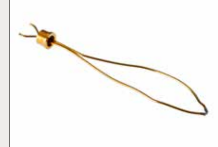
Manufacturing of temperature sensors (Illustration shows gilded platinum sensor)