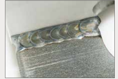
Welded joints of different materials