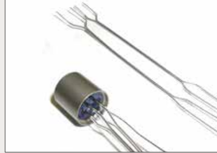
Fine welding of electronic components, e.g., thermocouples