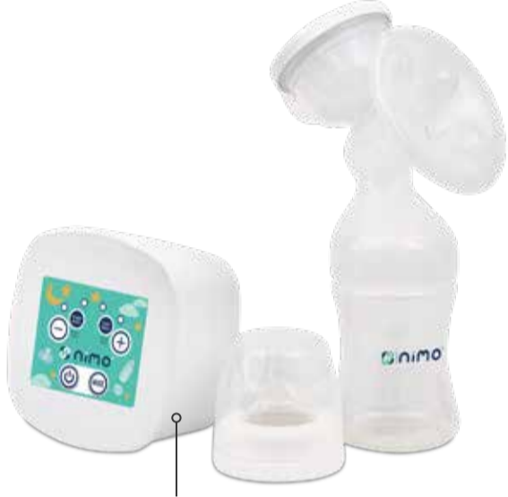
150 ml bottle capacity

Nimo ® Electronic Single Breast Pump is designed to be ergonomic and easy to use. It has two different suction modes, bionic rhythm and classical fixed rhythm, which imitate the baby's suction rhythms. The device starts operating in low-level mode, helping to initiate the mother's milk flow. With the 4-stage suction level of both modes, the mother can choose the most appropriate rhythm for milking. Thanks to the LED indicators, it can be easily seen which suction mode and which suction power it is in. Not only with electric power but also it can be used with 4 AA batteries. For this reason it can be also use on travel or places where there is no electricity.