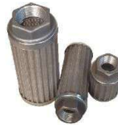
HYDRAULIC TANK SUCTION FILTERS WITH STUD (METAL)