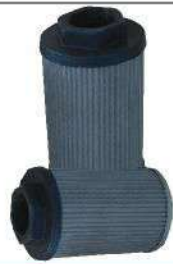
HYDRAULIC TANK SUCTION FILTERS WITH STUD (PLASTIC)