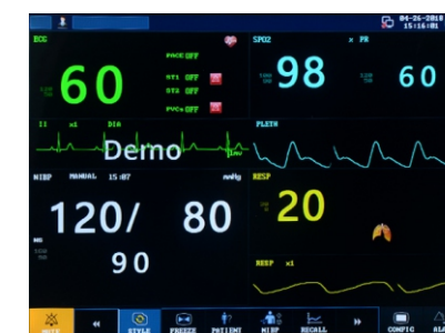
Big font interface