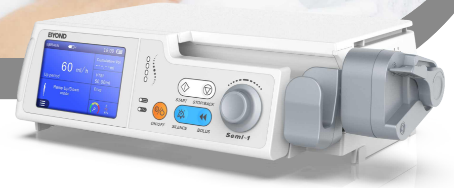
Sunfusion ® Syringe Pump Semi-1|Erch-3|Anim-5