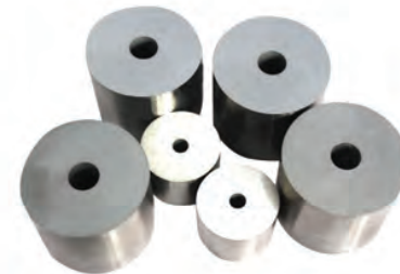
GT20 GT30 GT40 GT50 GT55