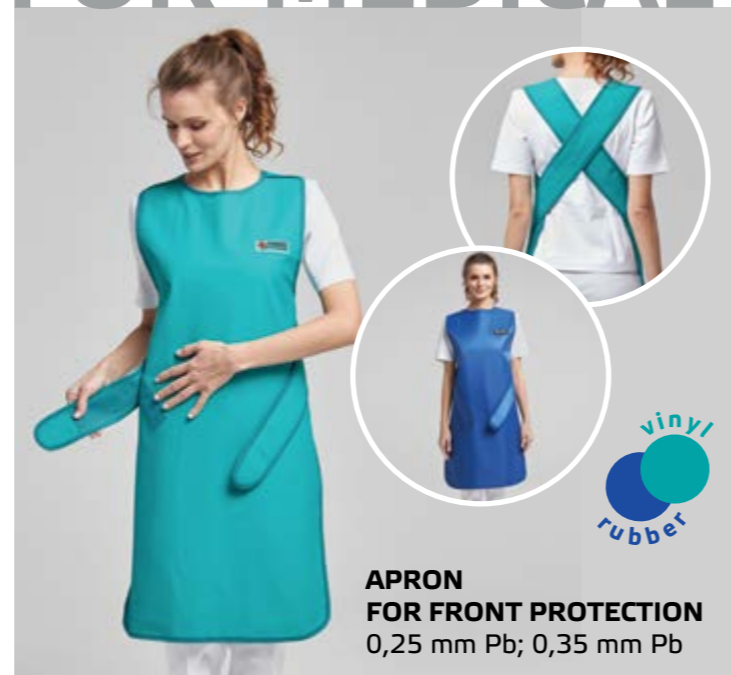
APRON FOR FRONT PROTECTION 0,25 mm Pb; 0,35 mm Pb vinyl rubber