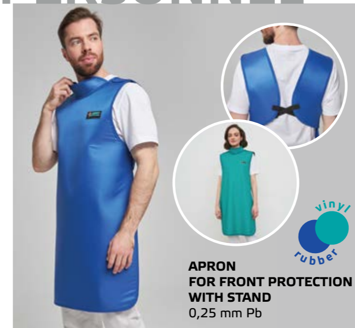
APRON FOR FRONT PROTECTION WITH STAND 0,25 mm Pb vinyl rubber