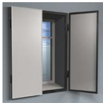
X-RAY PROTECTIVE DOORS WINDOWS SHUTTERS

© NP JSC AMICO, 2023. All rights reserved.