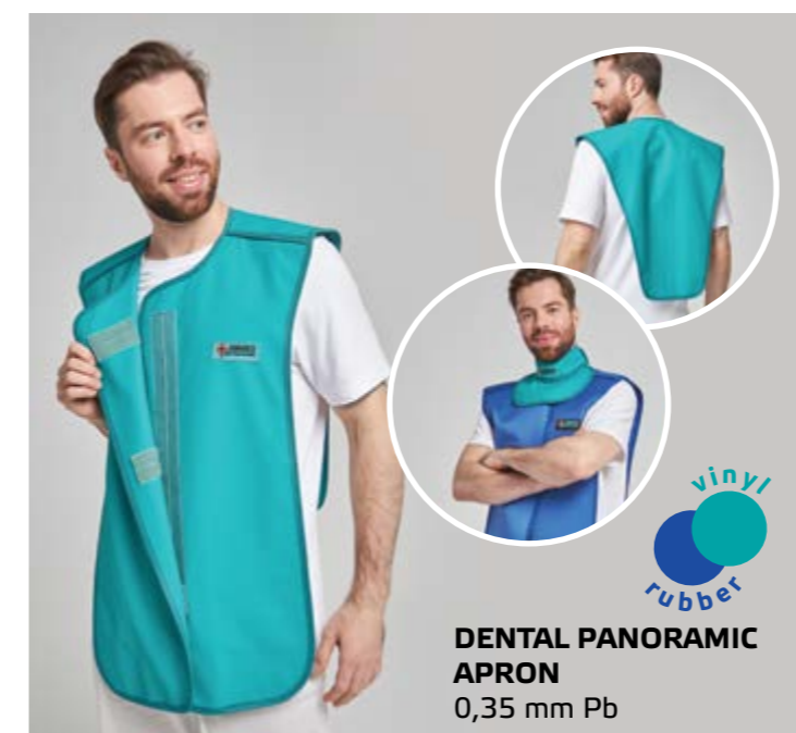
DENTAL PANORAMIC APRON 0,35 mm Pb vinyl rubber