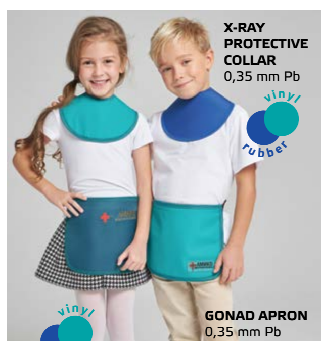
GONAD APRON 0,35 mm Pb vinyl rubber