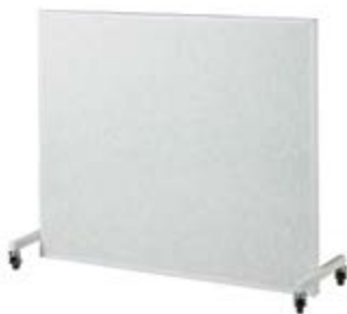
SMALL SHIELD FOR PATIENT