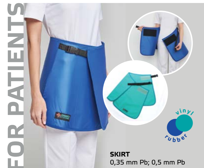
SKIRT 0,35 mm Pb; 0,5 mm Pb vinyl rubber