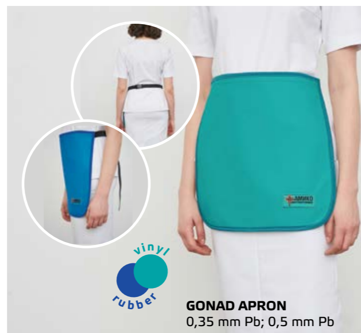
GONAD APRON 0,35 mm Pb; 0,5 mm Pb vinyl rubber