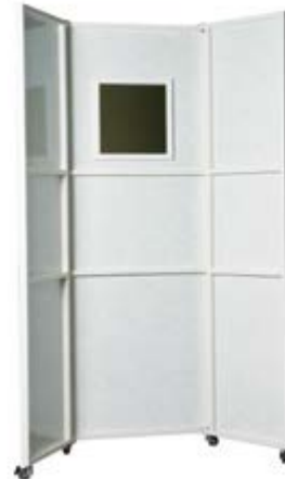
FRONT SHIELD WITH TWO SIDE PANELS