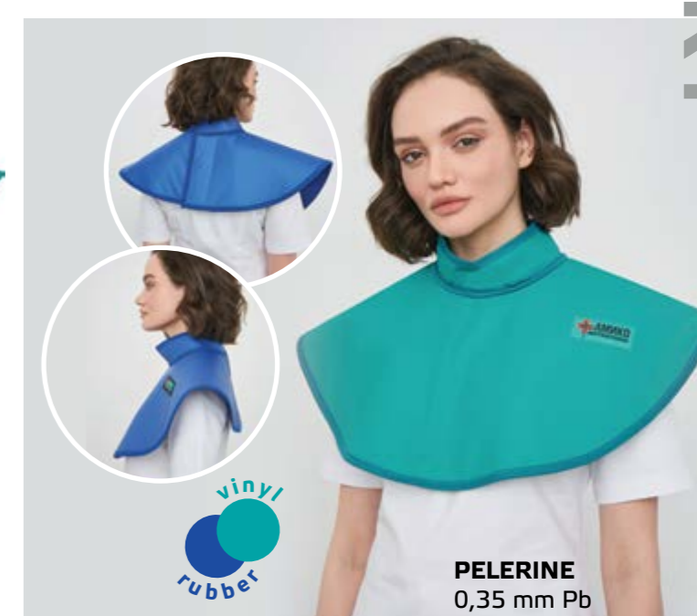
PELERINE 0,35 mm Pb vinyl rubber