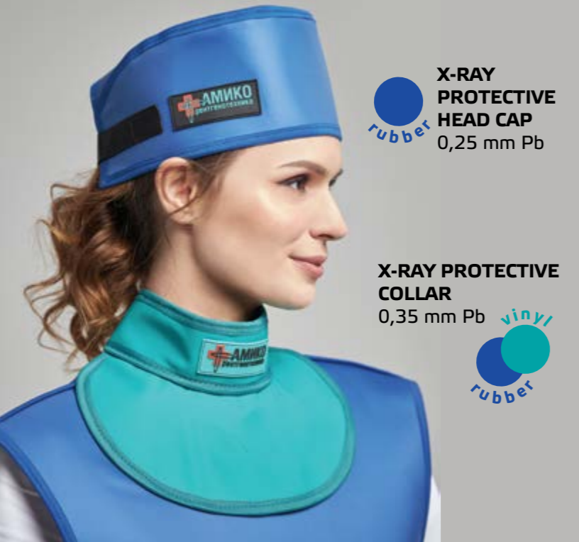
X-RAY PROTECTIVE HEAD CAP 0,25 mm Pb vinyl rubber