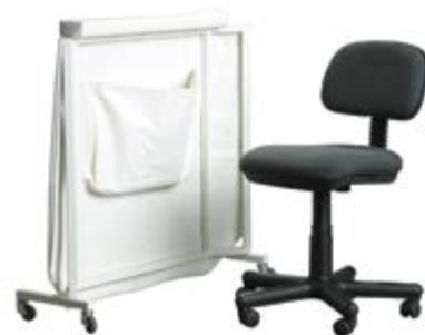
SMALL SHIELD FOR DOCTOR WITH CHAIR

The manufacturer reserves the right to make changes in complete, technical parameters and design of the equipment.