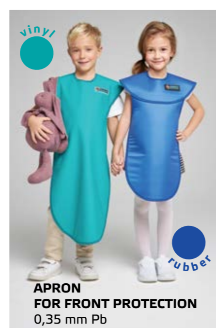
APRON FOR FRONT PROTECTION 0,35 mm Pb vinyl rubber