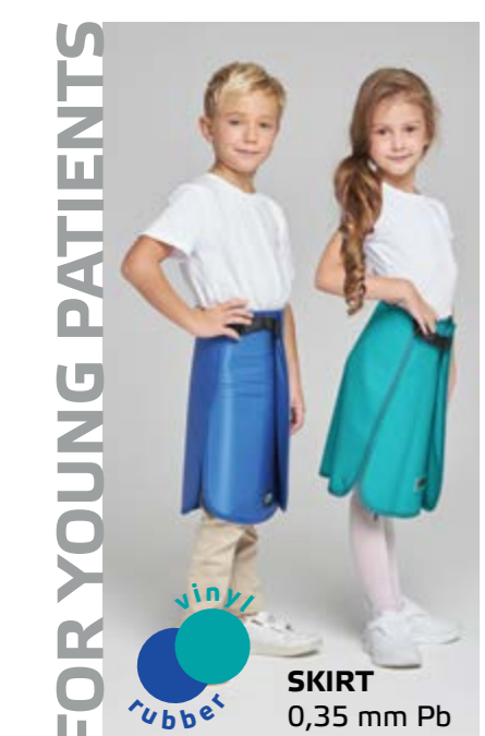
SKIRT 0,35 mm Pb vinyl rubber