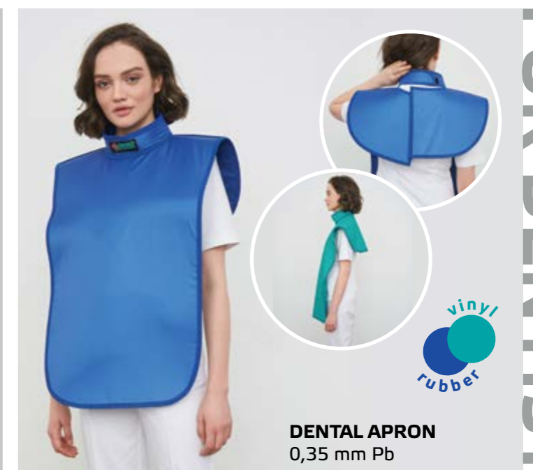
DENTAL APRON 0,35 mm Pb vinyl rubber