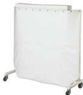
SMALL SHIELD FOR DOCTOR