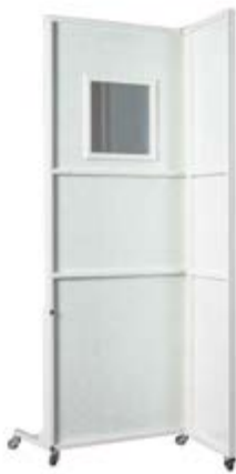
FRONT SHIELD WITH SIDE PANEL