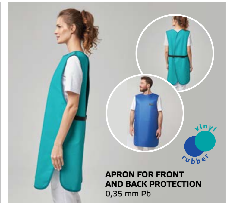
APRON FOR FRONT AND BACK PROTECTION 0,35 mm Pb vinyl rubber