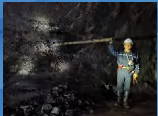
Penetration of directional drilling borehole