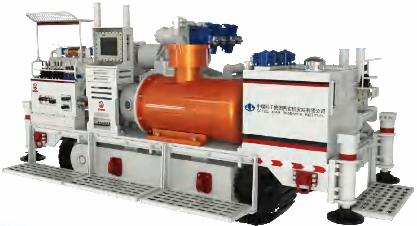
ZDY15000LD Full Hydraulic Inseam Directional Drilling Rig

It is applied to various mine drilling construction such as efficient extraction of coal mine gas, accurate detection for geological information, advanced and accurate disaster treatment causing by hidden dangers, and rapid emergency rescue in mine accidents.