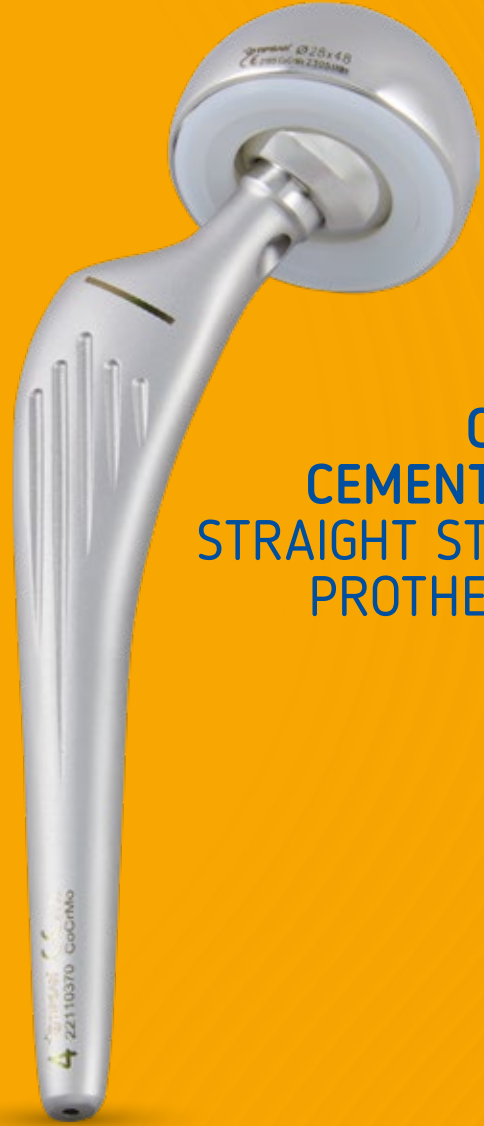
CTD CEMENTED STRAIGHT STEM PROTHESIS