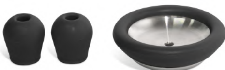
ABN™ CLASSIC OPTIMA Stethoscope Accessories Kit