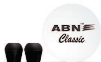
ABN™ CLASSIC Stethoscope Accessories Kit