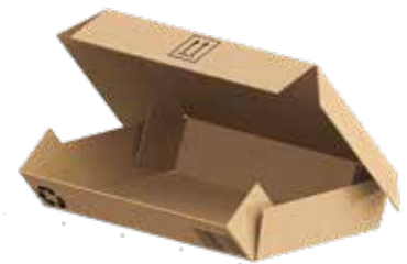
FEFCO-0410 BOX STYLE