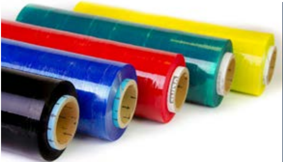
PALLET PE STRETCH FILM ROLLS