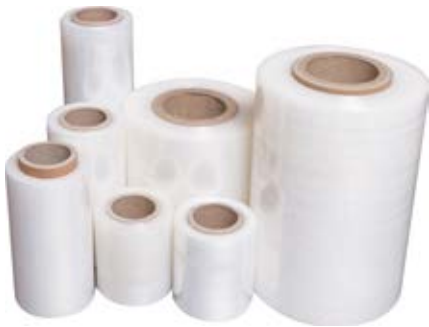
MACHINERY STRETCH FILM & MINI ROLLS

The machine is capable to slit and rewind various types of films as Polyethylene, PVC and Cling.