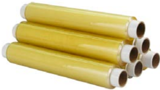
PVC CLING WRAPS - ALIMENTARY / FOOD STRETCH FILM ROLLS