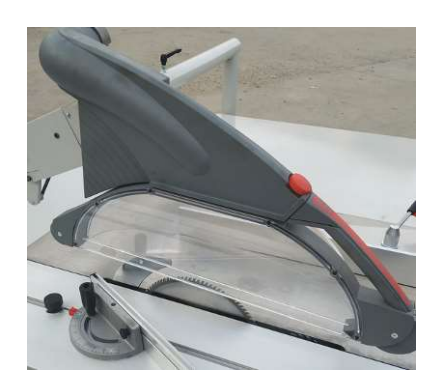
Big saw cover