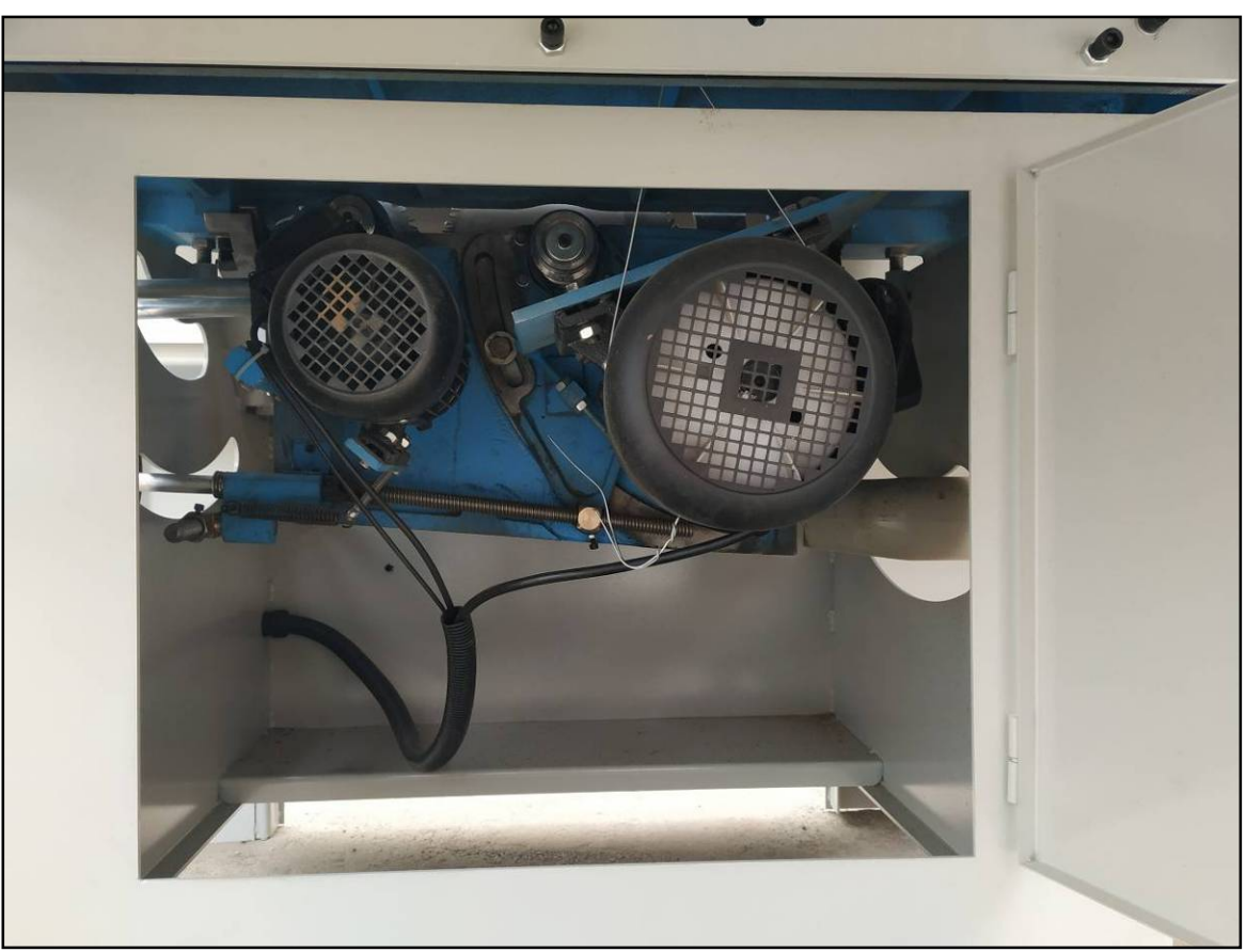
Page 6 of 7