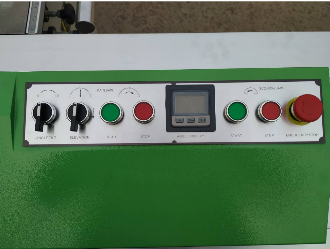
Page 3 of 7