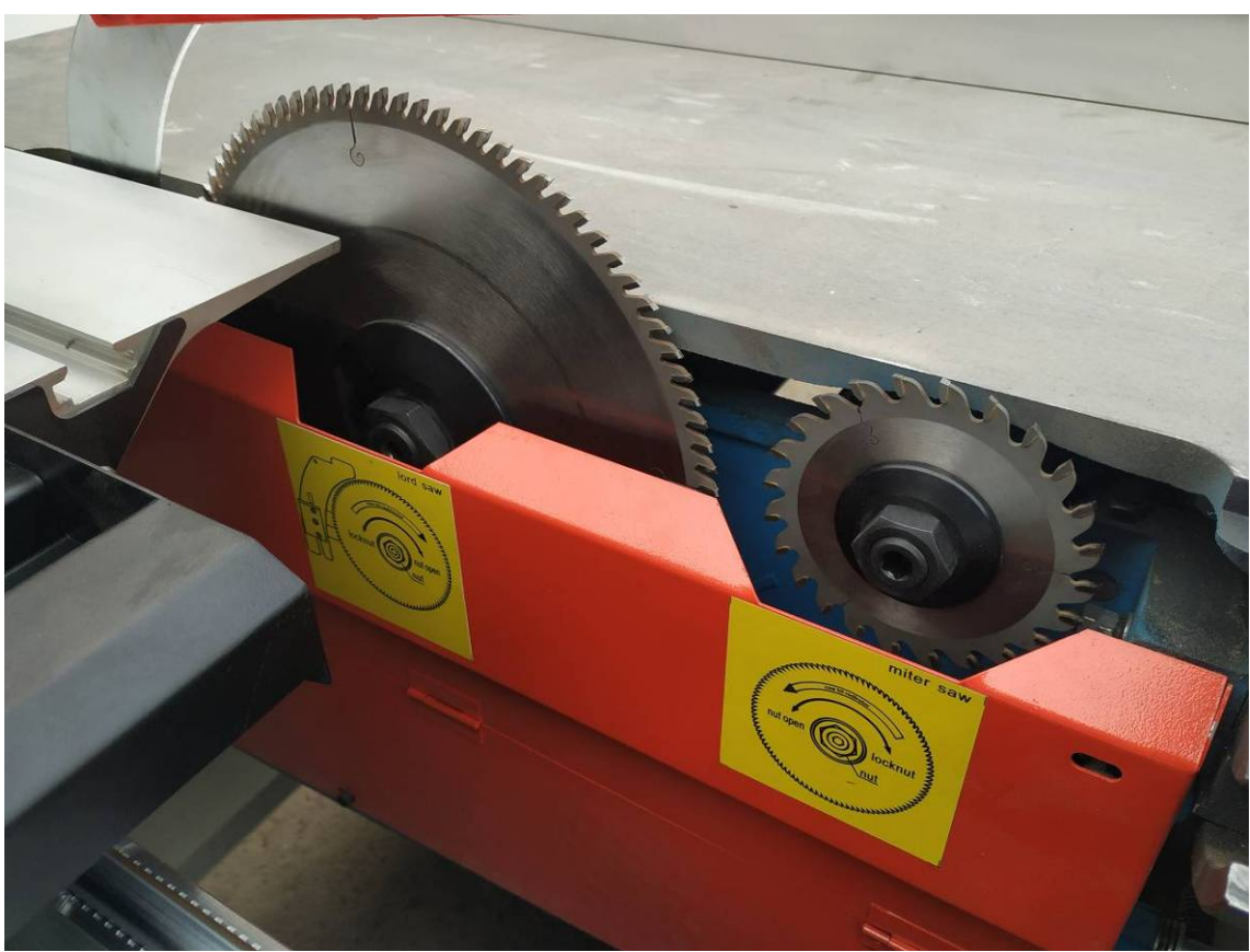
Page 5 of 7