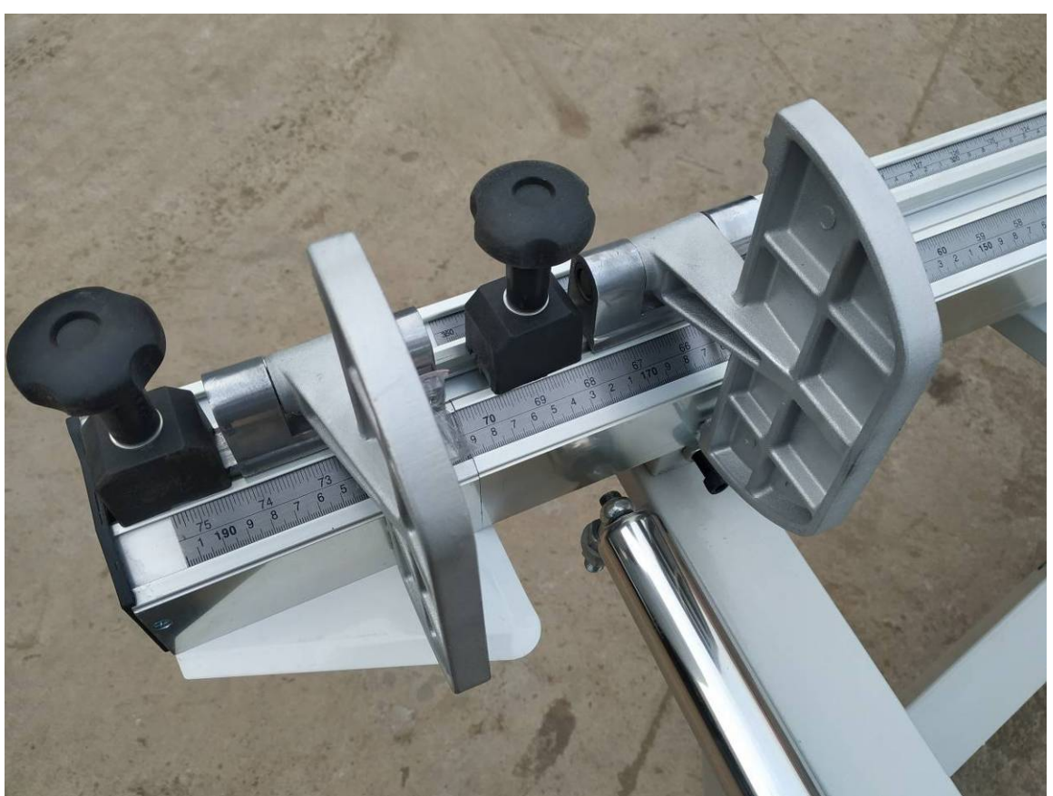
Page 4 of 7