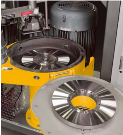
Mill Chamber with Disposable Discs