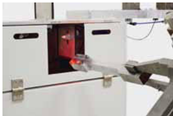
Optical measurement of the specimen in the automated test centre