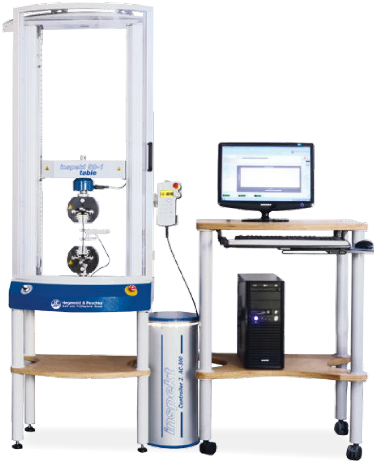
Universal testing machine Inspekt table 50 with safety door, wedge grips and a clip-on extensometer