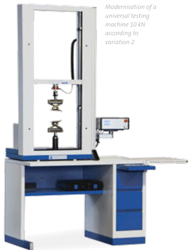
Modernisation of a universal testing machine 10 kN according to variation 2

The clients can count on a free software-service during the entire lifetime of the testing machine. The service-team advises not only regarding questions to the functions of testing machines and operator software, but provides also its expert knowledge in case of application problems and configuration of the test system according to specific norms free of charge.