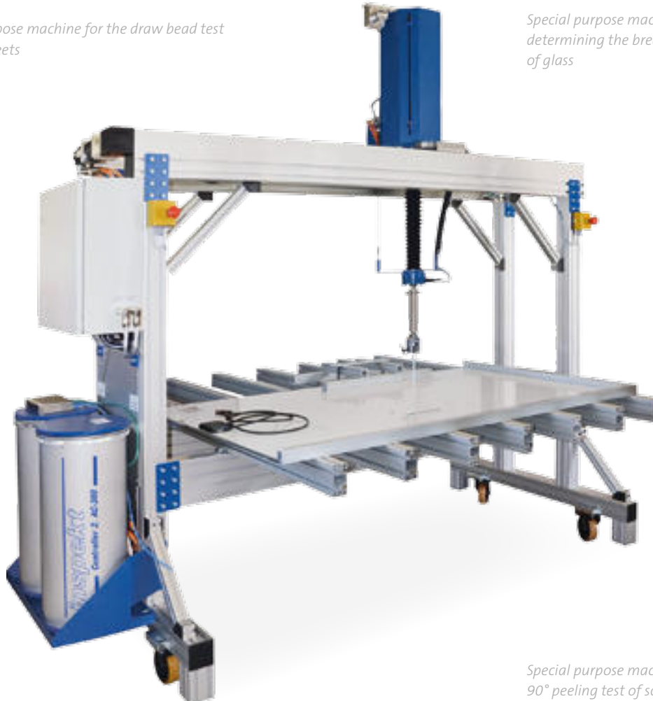
Special purpose machine for 90° peeling test of solar panels