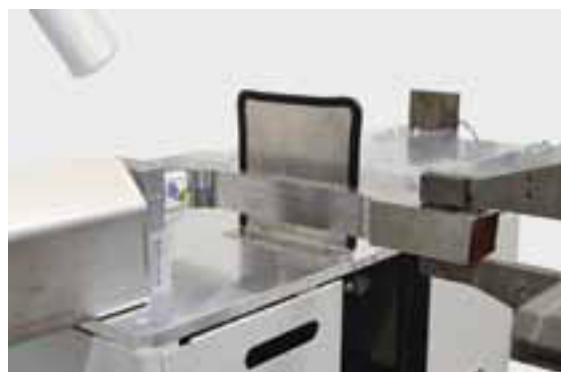
Specimen marking in the automated test centre