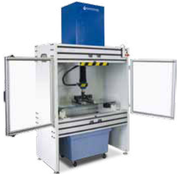
Special purpose machine for determining the breaking strength of glass