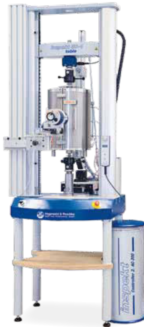
Universal testing machine Inspekt table 50 with high-temperature furnace up to 1,200 °C

In case the specimens are non-standardised specimen or specific components which cannot or can only be tested with great difficulty with conventional clamping devices, a special solution has to be considered, which is also offered by Hegewald & Peschke. These include also clamping concepts for high-temperature tests, for example for tensile tests at temperatures up to 1,600 °C.