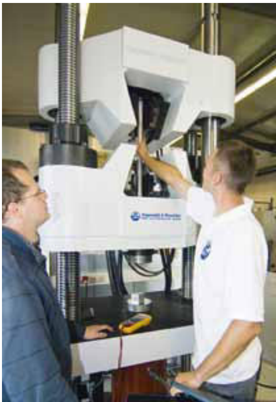
Briefing of the operators at the commissioning

Hegewald & Peschke offers its clients wide-ranging services. One of the most important is the commissioning of the machine on-site with factory or DAkkS calibration and briefing of the operating personnel. Furthermore, thorough retraining in the application laboratory from Hegewald & Peschke or directly with the client is possible.