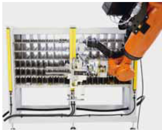
Sampling from the depot in the automated test centre

The test results are automatically transferred to a host-machine and can be managed directly by an ERP system.