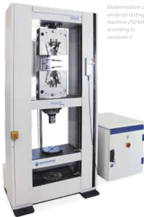
Modernisation of a universal testing machine 250 kN according to variation 3

With the most cost-effective modernisation alternative 1, the measurement channels of force, traverse and strain of the testing machine are captured and digitalised. With alternative 2, the existing regulation is replaced by a modern digital control. Alternative 3, which is the most extensive option, includes the retrofit with a modern digital control and complete drive. Only the load frame of the testing machine is used. In case of electromechanical testing machines, the existing drive is replaced by a modern brushless AC drive with servo amplifier.