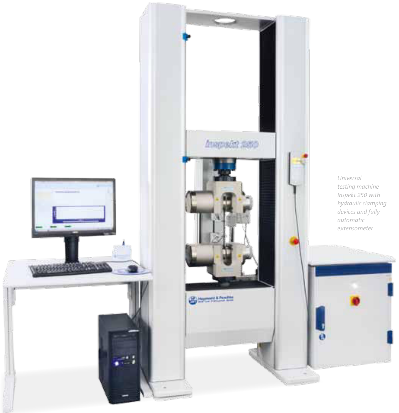
Universal testing machine Inspekt 250 with hydraulic clamping devices and fully automatic extensometer