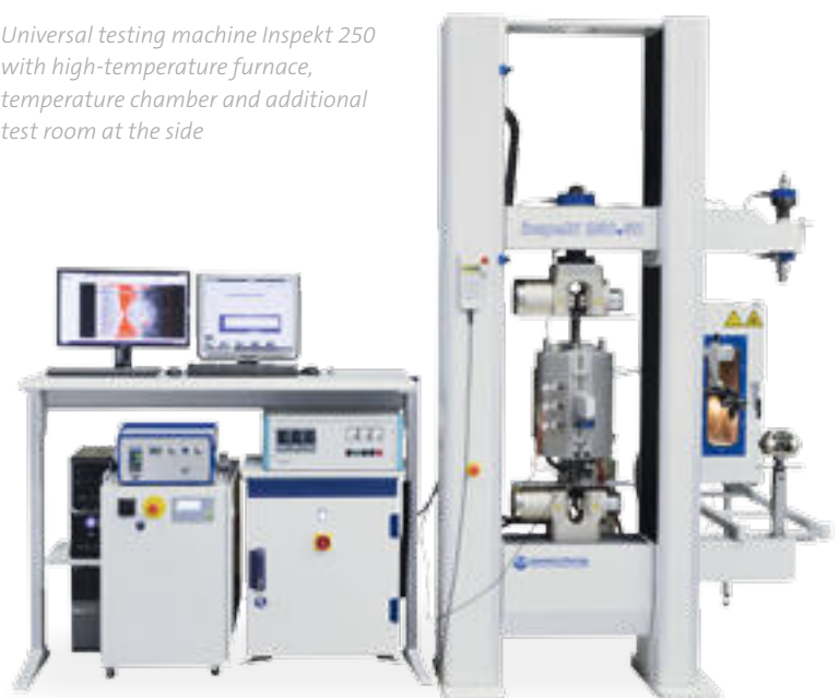
Universal testing machine Inspekt 250 with high-temperature furnace, temperature chamber and additional test room at the side