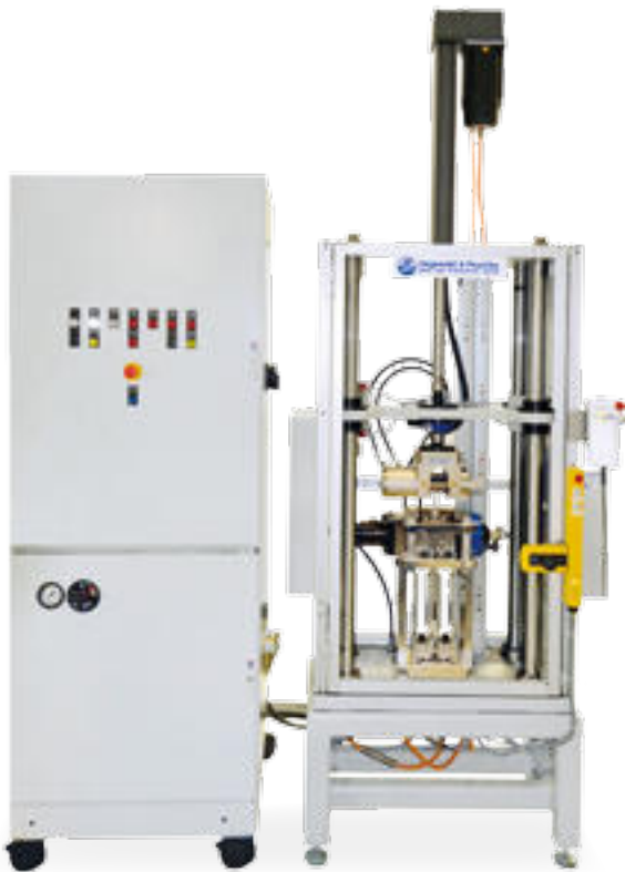
Special purpose machine for the draw bead test on body sheets