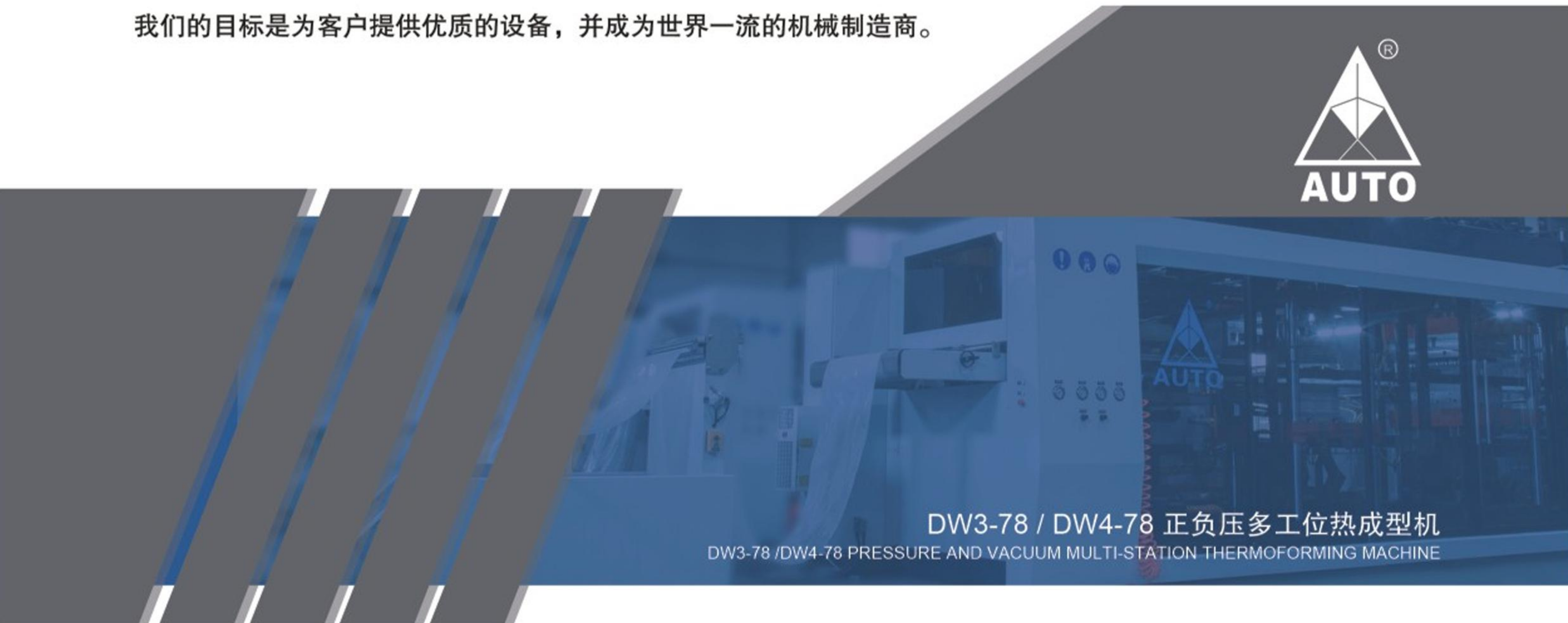
DW3-78 / DW4-78 正负压多工位热成型机 DW3-78 / DW4-78 PRESSURE AND VACUUM MULTI-STATION THERMOFORMING MACHINE

SHANTOU AUTO PACKAGING MACHINERY CO., LTD. Is a professional manufacturer integrated with R&D, manufacturing and sales service. We are located at Shantou, Guangdong, China. We started manufacturing disposable product in 1992, more than 20 years effort now we have both disposable product factory and machinery factory. Our machine factory covers a land of 7600m 2 and our annual revenue reaches US$5 Million. Our major products are plastic sheet extruders and thermoforming machines. We have our own R&D department with our experienced engineer team which guarantee the best quality of product, professional & efficient machinery maintenance and after sale service.