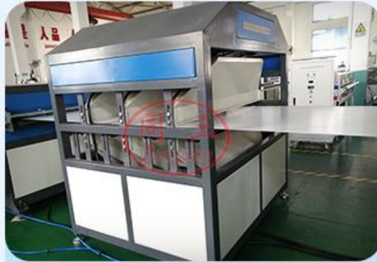
Fan cooling device, better cooling effect, high production speed