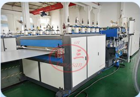
First haul off device, Imported nitrile roller, helical gear drive, stable operation