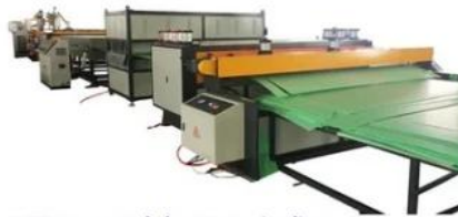
2, PP corrugated sheet Extrusion line