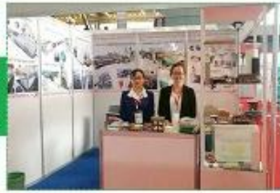
The 15th International 3P Exhibition in Lahar