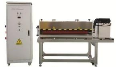
3, Surface Corona machine