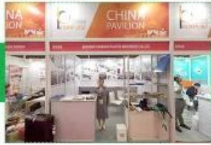
India Plas 2019