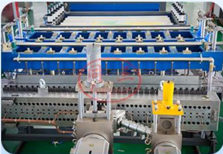
No-stop double position hydraulic screen changer