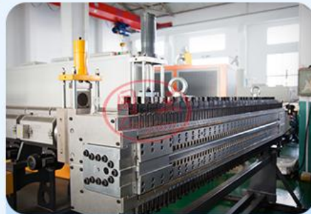
High quality mold with special design for PP hollow sheet