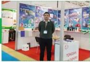
Interplastica 2019 In In Moscow, Russia