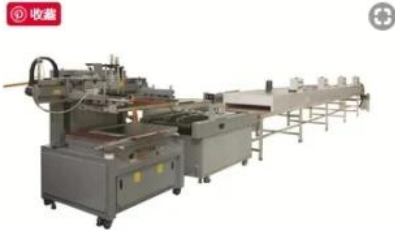
4, Design printing machine