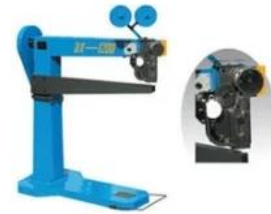
6, Box Edge Sealing machine