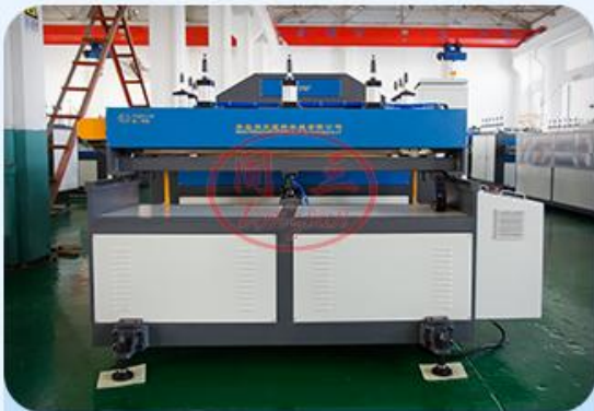
Cutter with PLC control and servo motor