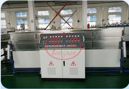
Oven, stress removal device

Contact: Sophie Qin Whatsapp/wechat:+86 15063923327 Email :salersophie@tongsanextruder.com