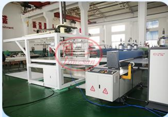
Fan cooling device, better cooling effect, high production speed