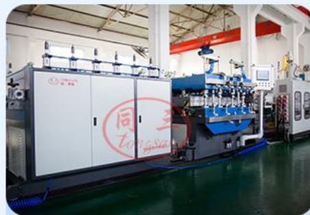
Six rollers and three rollers haul off with servo motor