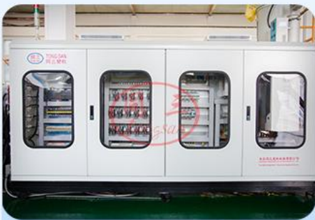
Visual electric cabinet, world-renowned brand electric device

Qingdao Tongsan Plastic Machinery co.,Ltd is the PP Hollow Corrugated Sheet Extrusion Machine Professional Manufacturer. We also provide complete solution for Printing, Die cutting, Cartonplast Box Making, Edge Sealing etc.