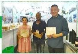
Piast Print Pack Ethiopia 2019