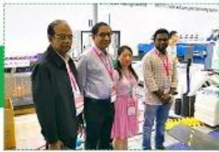
China Plas 2019