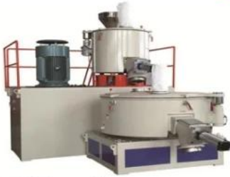
1, Material Mixer machine