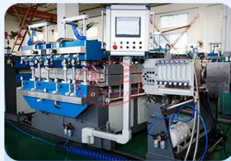
PLC controller, easy to operate and easy to learn