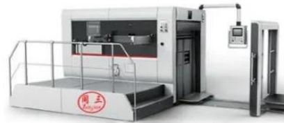
5, Shape Die cutting machine