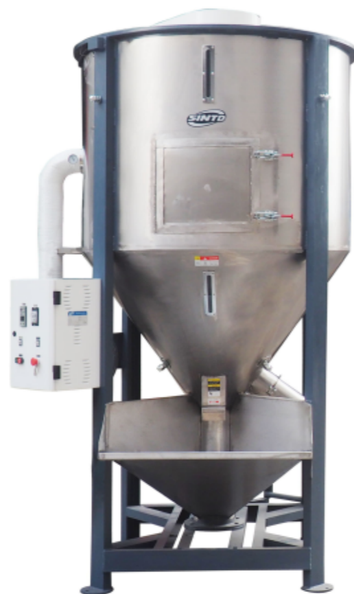
大型立式拌料机(加热型) Large-Scale vertical mixer