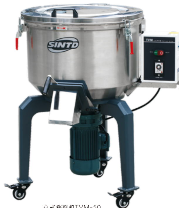
立式拌料机TVM-50 Vertical mixer