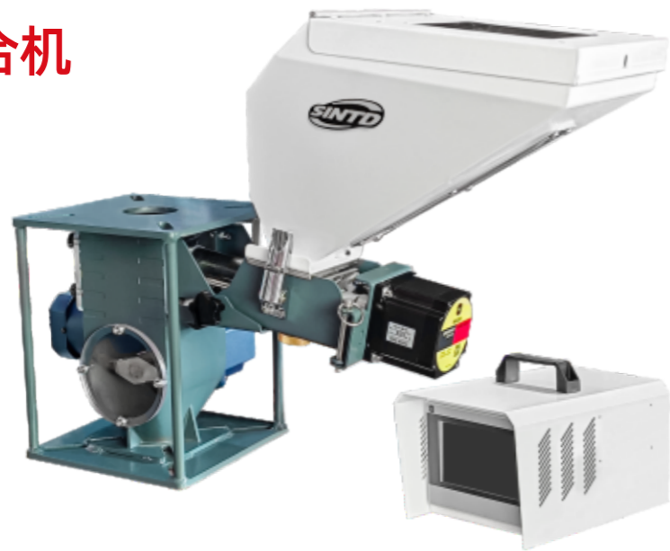
TCM-30单色计量式色母混合机 Single-color Volumetric Doser