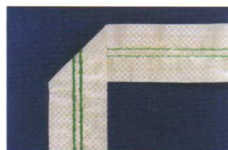
HDPE Wovenbag stitched with HDPE Tape.