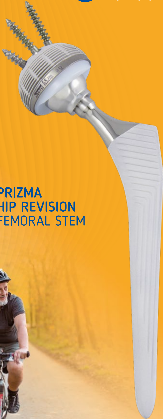
PRIZMA HIP REVISION FEMORAL STEM