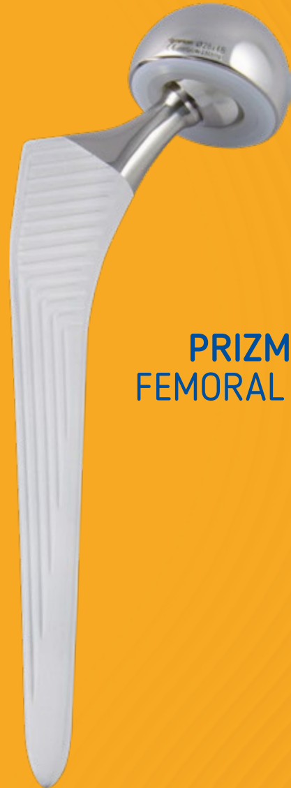
PRIZMA HIP FEMORAL STEM