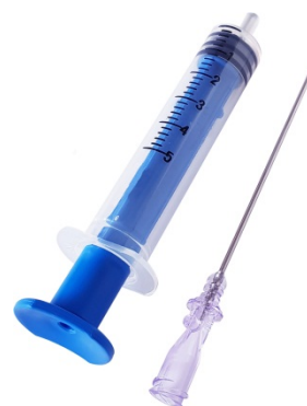
Guide Wire Syringe with Straight Introducer Needle Item Code # 3061G, 3062G, 3063G