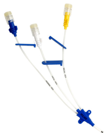
Triple Lumen CVC Item Code # 3063