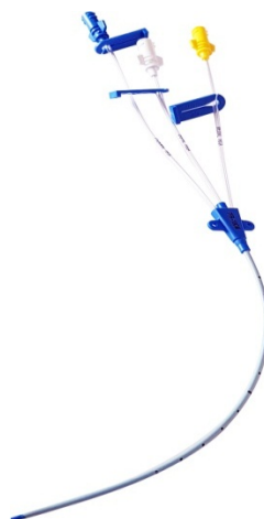
Antimicrobial Coated Item Code # 3061C, 3062C, 3063C