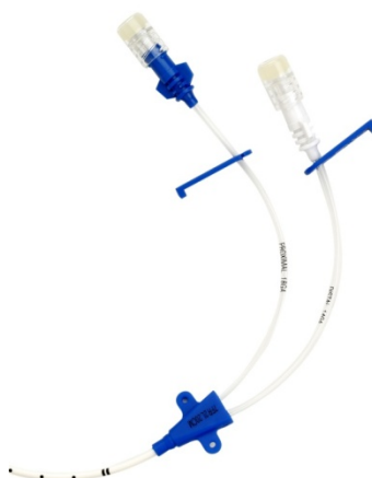
Double Lumen CVC Item Code # 3062