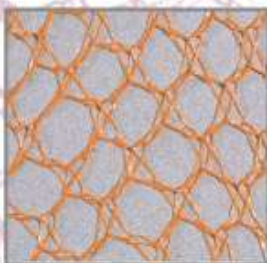
R 101 R 102 Rhombus