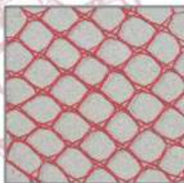
K 701 Small Square