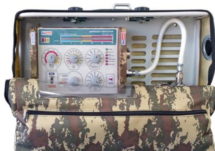
Design Variations with Bag