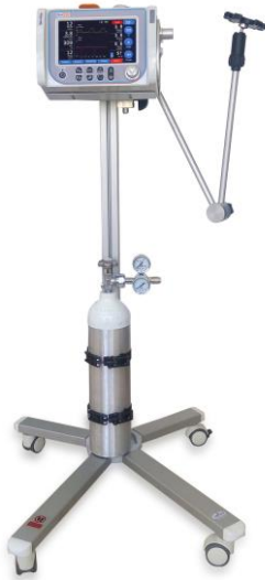
Ventilator Cart with tube holder