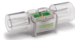
Neonatal Flow Sensor