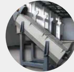
Inclined Friction Washer