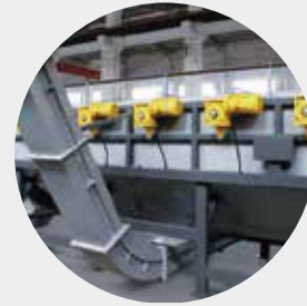
Float-Sink Washing Tank