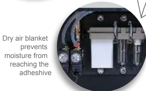
Dry air blanket prevents moisture from reaching the adhesive