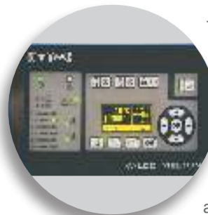
The integrated grammage control, accessible through a multi-function controller, simplifies operator's programming tasks to eliminate product loss and downtime associated with incorrect coat weight adjustments.