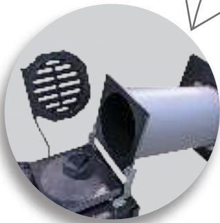
Faster and safer maintenance and cleaning operations thanks to its tiltable tank and removable melting grid.