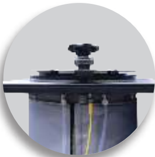
Air-tight tank opening and blowing system.