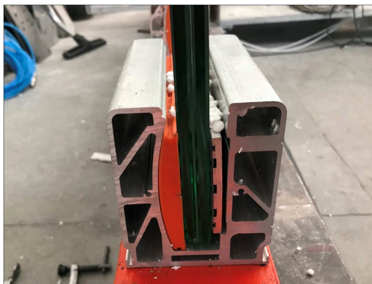
Photographs of the item