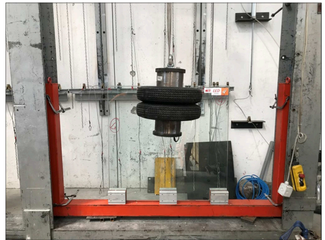
Photographs of the item after the impacts