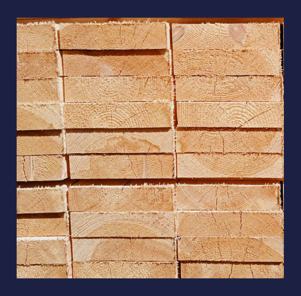
Edged sawn timber