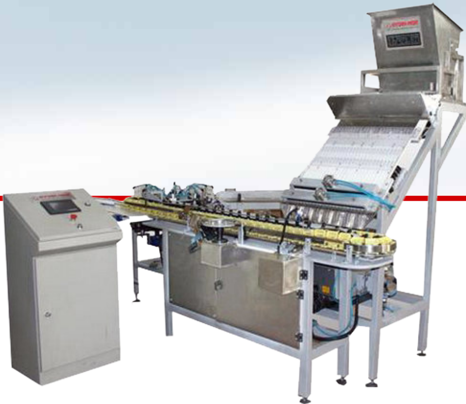
Automatic Boxing and Filling Machine