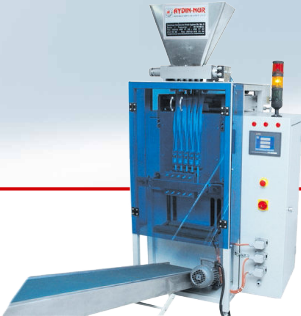
Stick Pack Packaging Machine