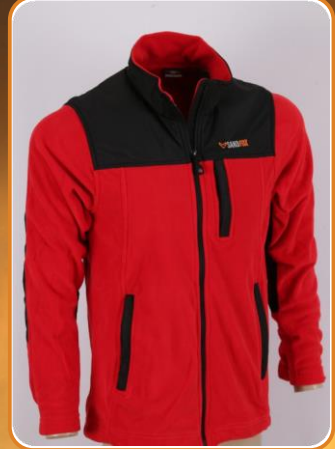
Zeus – Micro Fleece Jacket With Reinforcement, Light, Warm, Soft, YKK Zipper