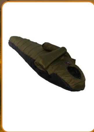
Snow Storm (-22.7) – Nylon Fabrics, 3D Micro Fiber Insulation, 2 Arms Sleeves