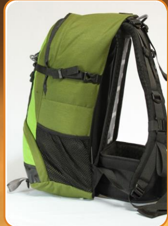
Onyx 30 – HQ backpack for trekking, Ergonomic and Comfortable Back System With Mesh, YKK Zippers and plastic parts, 2 Ice-Axe holders, Sleeping bag partition, Rain cover