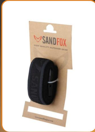
Stealth Flexible Belt – 100% Polyester Fabrics, All YKK Accessories