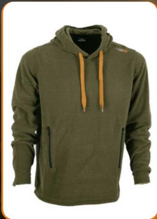
Relax – Plaid Micro Fleece Hoody, Light, Warm, Soft, YKK Zipper