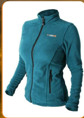
Athena – Micro Fleece Jacket With Reinforcement, Light, Warm, Soft, YKK Zipper