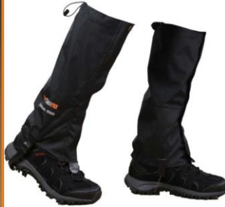
Icetech 6000 – Waterproof and Breathable Fabrics, Ergonomic, All YKK Accessories