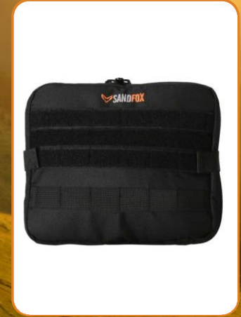
TFA 1 — Cordura Fabrics Shoulder Bag, YKK zippers and plastic parts