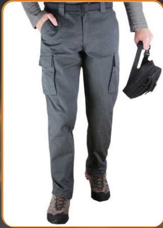
Trek T2 – Water Repellent, RIPSTOP Fabrics, 50% Polyester, 50% Cotton, Fade Proof