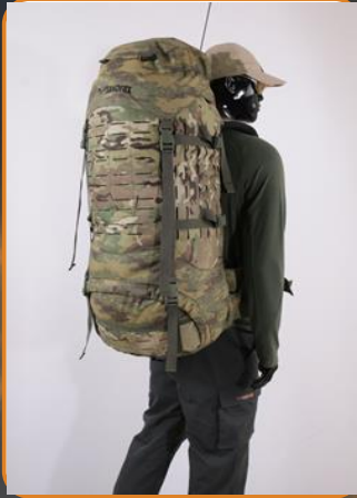
DeltaForce 60 — HQ backpack, Ergonomic Back System, YKK Zippers and plastic parts, 2 Ice-Axe with Reinforcements, 2 Side-Pockets, 2 Front Pockets, Sleeping bag partition, Rain cover