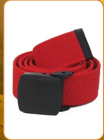
Stealth Flexible Belt – 100% Polyester Fabrics, All YKK Accessories