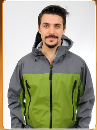
Zagros 3L Shell – Technical Shell, High Performance Fabric, 3 Layer Nylon Ripstop, Over 20000 GR/M2/24H, Over 10000WP, YKK Zipper