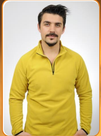
Cool 200 – Micro Fleece, Light, Warm, Soft, YKK Zipper