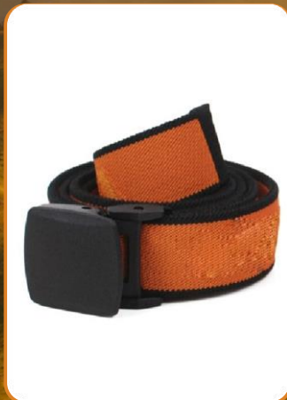
Stealth Flexible Belt – 100% Polyester Fabrics, All YKK Accessories