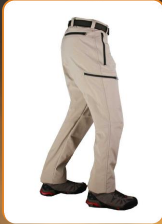
Alaska – Technical Soft Shell, Highly Breathable, Water Proof, Durable, YKK Zipper