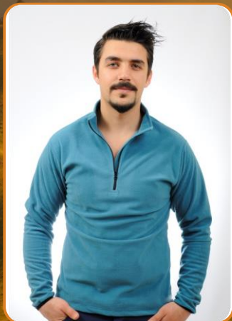
Cool 200 – Micro Fleece, Light, Warm, Soft, YKK Zipper