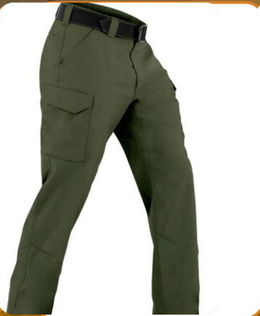
Tactic Pro3 – Water Repellent, RIPSTOP Fabrics, 50% Polyester, 50% Cotton, Fade Proof