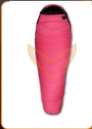
Ice Storm (-26.4) – Nylon Fabrics, 3D Micro Fiber Insulation