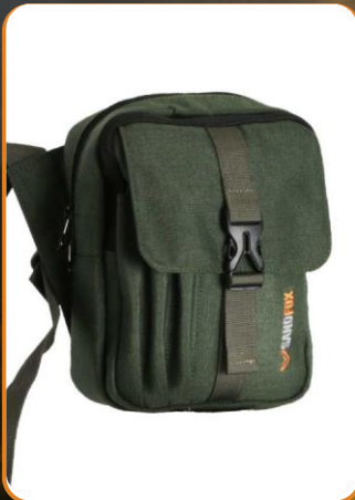
Stone 1 — Cordura Fabrics Shoulder Bag, YKK Zippers and plastic parts