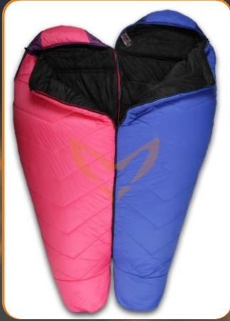
Ice Storm (-26.4) – Nylon Fabrics, 3D Micro Fiber Insulation