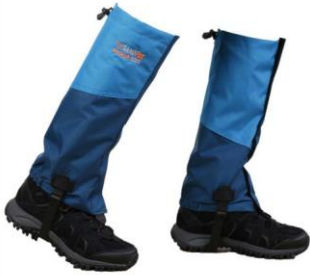
Icetech 3000 – Waterproof PU Coating Fabrics, Ergonomic, All YKK Accessories