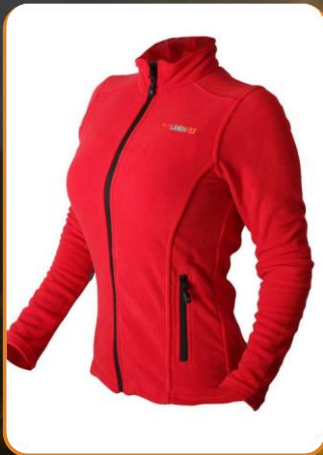
Athena – Micro Fleece Jacket With Reinforcement, Light, Warm, Soft, YKK Zipper