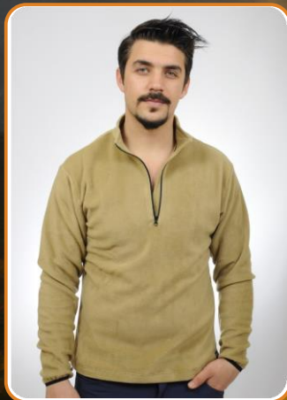
Cool 200 – Micro Fleece, Light, Warm, Soft, YKK Zipper