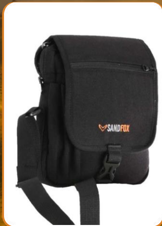
Stone 2 — Cordura Fabrics Shoulder Bag, YKK Zippers and plastic parts