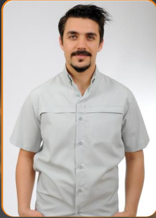
Zigana T1 – Anti Bacterial, UPF +30, Water Repellent, RIPSTOP Fabrics