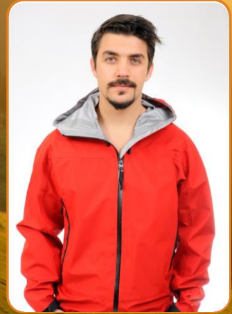
Cilo 3L Shell – Technical Shell, High Performance Fabric, 3 Layer Nylon Ripstop, Over 10000 GR/M2/24H, Over 10000WP, YKK Zipper