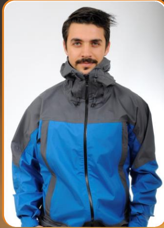
Sabalan 3L Shell – Technical Shell, High Performance Fabric, 3 Layer Nylon Ripstop, Over 20000 GR/M2/24H, Over 10000WP, YKK Zipper