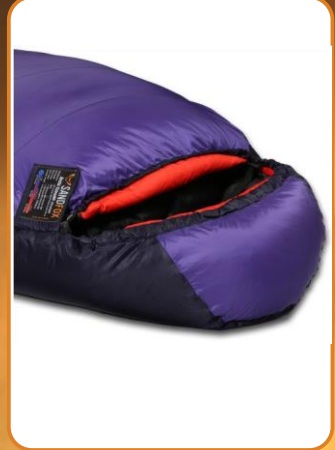
Nordic Extreme (-30) – 90/10 EU Goose Down, RIPSTOP Nylon Fabrics