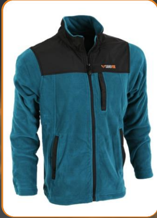
Zeus – Micro Fleece Jacket With Reinforcement, Light, Warm, Soft, YKK Zipper