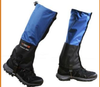
Icetech 6000 – Waterproof and Breathable Fabrics, Ergonomic, All YKK Accessories