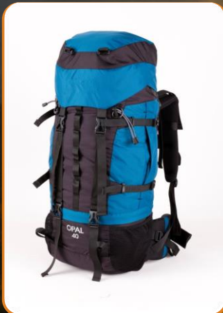
Opal 40 – HQ backpack for trekking and mountaineering, Ergonomic and Comfortable Back System With Mesh, YKK Zippers and plastic parts, 2 Ice-Axe holders, Sleeping bag partition, Rain cover, 2 Side Pockets