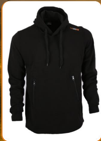
Relax – Stretch Micro Fleece Hoody, Light, Warm, Soft, YKK Zipper