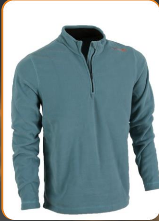
Cool 200 – Micro Fleece, Light, Warm, Soft, YKK Zipper