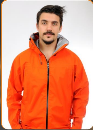
Cilo 3L Shell – Technical Shell, High Performance Fabric, 3 Layer Nylon Ripstop, Over 10000 GR/M2/24H, Over 10000WP, YKK Zipper