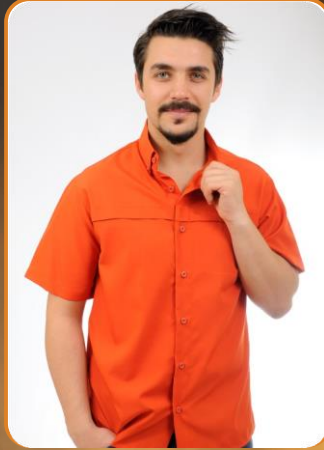
Zigana T1 – Anti Bacterial, UPF +30, Water Repellent, RIPSTOP Fabrics