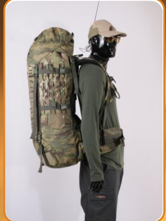
SP-Bazalt 60+10 – HQ backpack, Ergonomic Back System, YKK Zippers and plastic parts, 2 Ice-Axe with Reinforcements, 2 Side Pockets, 2 Front Pockets, Sleeping bag partition, Rain cover