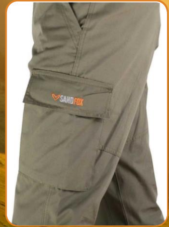
Trek T2 – Water Repellent, RIPSTOP Fabrics, 50% Polyester, 50% Cotton, Fade Proof