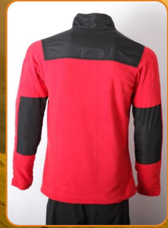
Zeus – Micro Fleece Jacket With Reinforcement, Light, Warm, Soft, YKK Zipper