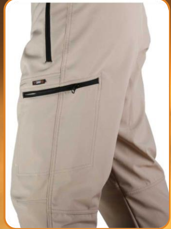
Alaska – Technical Soft Shell, Highly Breathable, Water Proof, Durable, YKK Zipper