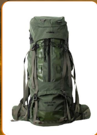
Bazalt 50+10 – HQ backpack, Ergonomic Back System, YKK Zippers and plastic parts, 2 Ice-Axe with Reinforcements, 2 Side Pockets, 2 Front Pockets, Sleeping bag partition, Rain cover