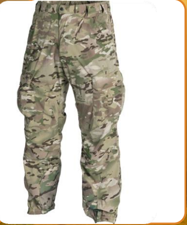
Tactic Pro4 – Water Repellent, RIPSTOP Fabrics, 50% Polyester, 50% Cotton, Fade Proof