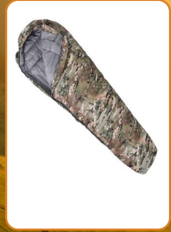
Nordic Extreme Tactic(-30) – 90/10 EU Goose Down, RIPSTOP Nylon Fabrics