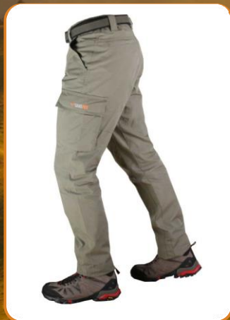
Trek T2 – Water Repellent, RIPSTOP Fabrics, 50% Polyester, 50% Cotton, Fade Proof