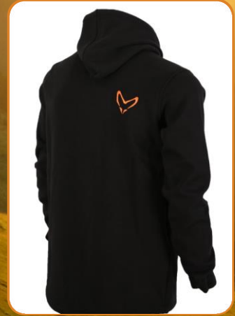
Relax – Stretch Micro Fleece Hoody, Light, Warm, Soft, YKK Zipper