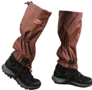
Icetech 2000 – Waterproof PU Coating Fabrics, Ergonomic, All YKK Accessories