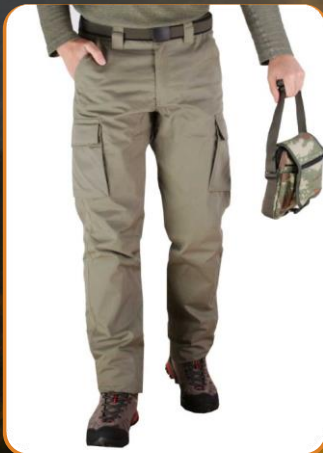
Trek T2 – Water Repellent, RIPSTOP Fabrics, 50% Polyester, 50% Cotton, Fade Proof