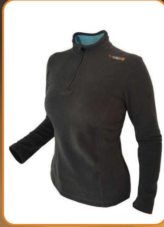
Cool 200 – Micro Fleece, Light, Warm, Soft, YKK Zipper