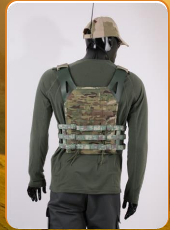
Super Light Plate Carrier – 500D Cordura Fabrics, Ergonomic Back System, 3 Cartridge Holders, Adjustable.