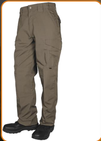
Tactic Pro2 – Water Repellent, RIPSTOP Fabrics, 90% Polyester, 50% Cotton, Fade Proof