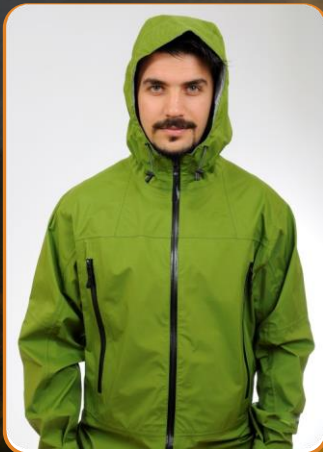
Cilo 3L Shell – Technical Shell, High Performance Fabric, 3 Layer Nylon Ripstop, Over 10000 GR/M2/24H, Over 10000WP, YKK Zipper