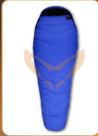
Ice Storm (-26.4) – Nylon Fabrics, 3D Micro Fiber Insulation