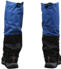
Icetech 6000 – Waterproof and Breathable Fabrics, Ergonomic, All YKK Accessories