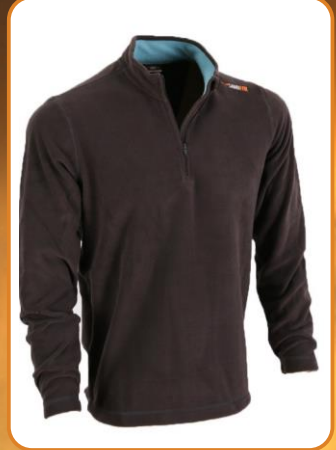
Cool 200 – Micro Fleece, Light, Warm, Soft, YKK Zipper