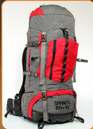
Granite 60+10 – HQ backpack, Ergonomic Back System, YKK Zippers and plastic parts, 2 Ice-Axe with Reinforcements, 2 Side Pockets, 2 Front Pockets, Sleeping bag partition, Rain cover