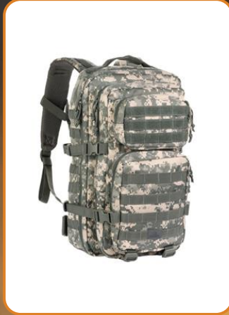
Tactic40 — HQ backpack, Ergonomic Back System, YKK Zippers and plastic parts, 2 Ice-Axe Holders, 2 Side Pockets, Rain cover