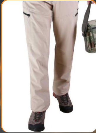
Alaska – Technical Soft Shell, Highly Breathable, Water Proof, Durable, YKK Zipper