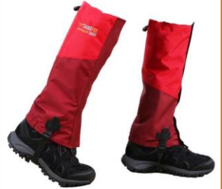
Icetech 3000 – Waterproof PU Coating Fabrics, Ergonomic, All YKK Accessories