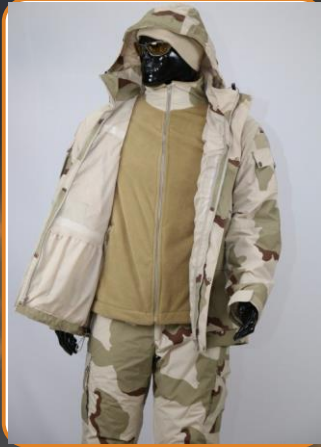
Tactical Winter Suit – Waterproof and Breathable Polyester Fabrics, All YKK Accessories