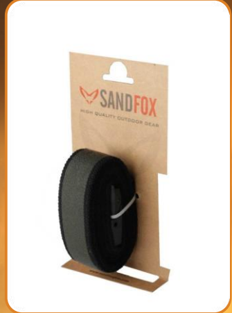
Stealth Flexible Belt – 100% Polyester Fabrics, All YKK Accessories