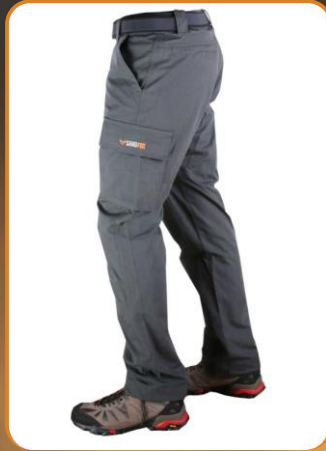
Trek T2 – Water Repellent, RIPSTOP Fabrics, 50% Polyester, 50% Cotton, Fade Proof