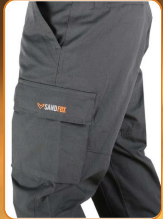
Trek T2 – Water Repellent, RIPSTOP Fabrics, 50% Polyester, 50% Cotton, Fade Proof