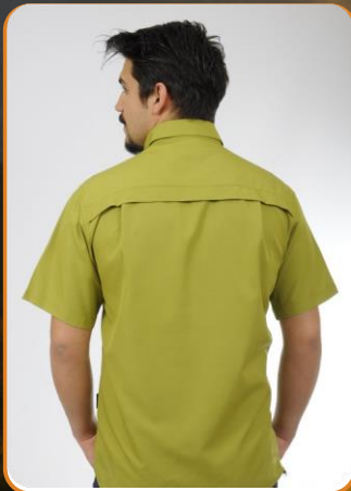
Zigana T1 – Anti Bacterial, UPF +30, Water Repellent, RIPSTOP Fabrics