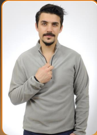
Cool 200 – Micro Fleece, Light, Warm, Soft, YKK Zipper