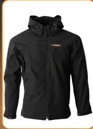
Nepal Softshell – Technical Light Shell, High Performance Fabric, 2,5 Layer Nylon Ripstop, Over 20000 GR/M2/24H, Over 10000WP, YKK Zipper