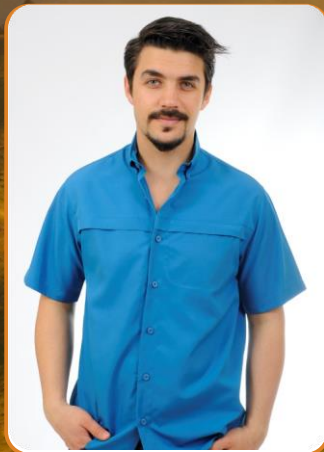
Zigana T1 – Anti Bacterial, UPF +30, Water Repellent, RIPSTOP Fabrics