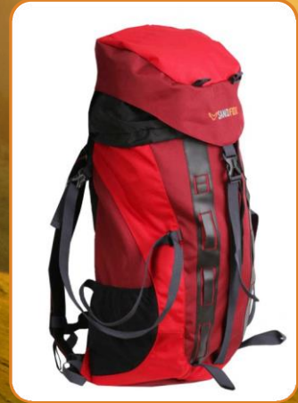
Sillis 35+5 – HQ backpack, Ergonomic Back System, YKK Zippers and plastic parts, 2 Ice-Axe Holders, 2 Side Pockets, Rain cover