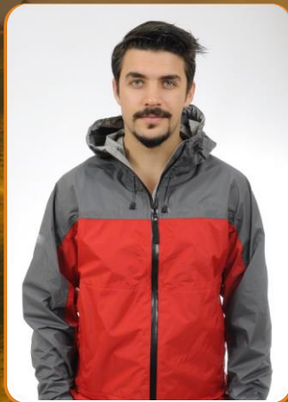
Cilo 2,5L Shell – Technical Light Shell, High Performance Fabric, 2,5 Layer Nylon Ripstop, Over 20000 GR/M2/24H, Over 10000WP, YKK Zipper