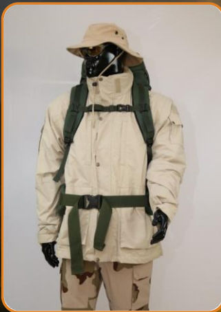
Tactical Winter Suit – Waterproof and Breathable Polyester Fabrics, All YKK Accessories