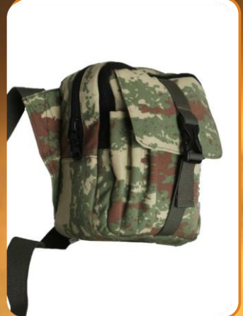
Stone 1 — Cordura Fabrics Shoulder Bag, YKK Zippers and plastic parts