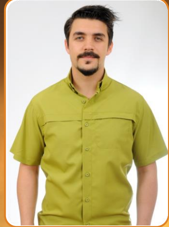
Zigana T1 – Anti Bacterial, UPF +30, Water Repellent, RIPSTOP Fabrics