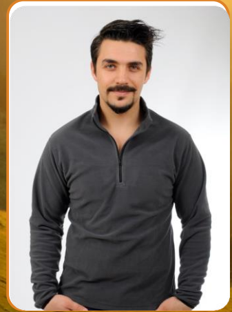
Cool 200 – Micro Fleece, Light, Warm, Soft, YKK Zipper