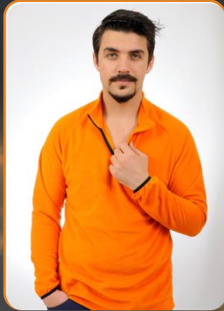
Cool 200 – Micro Fleece, Light, Warm, Soft, YKK Zipper