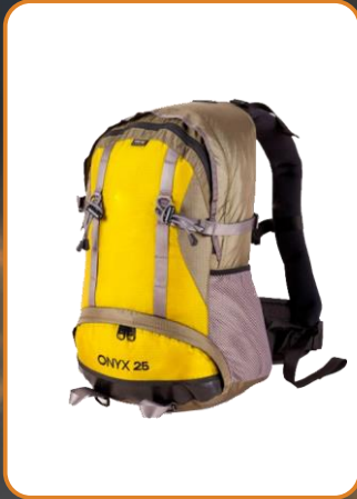
Onyx 25 – HQ backpack for trekking, Ergonomic and Comfortable Back System With Mesh, YKK Zippers and plastic parts, 2 Ice-Axe holders, Sleeping bag partition, Rain cover