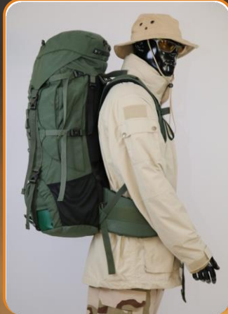
Bazalt 50+10 – HQ backpack, Ergonomic Back System, YKK Zippers and plastic parts, 2 Ice-Axe with Reinforcements, 2 Side Pockets, 2 Front Pockets, Sleeping bag partition, Rain cover