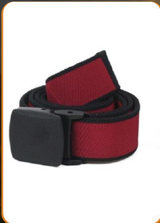
Stealth Flexible Belt – 100% Polyester Fabrics, All YKK Accessories