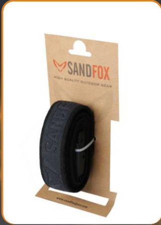
Stealth Flexible Belt – 100% Polyester Fabrics, All YKK Accessories