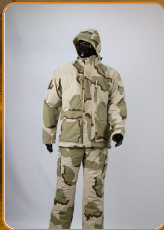
Tactical Winter Suit – Waterproof and Breathable Polyester-Fabrics, All YKK-Accessories