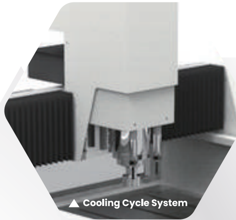
▲ Cooling Cycle System