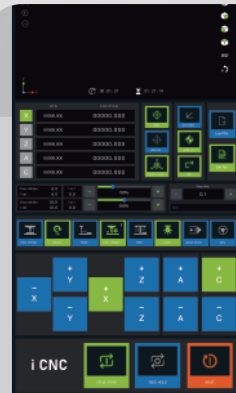
▲ i-CNC Controller