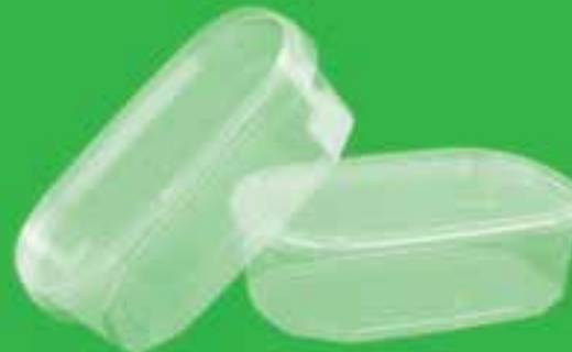
1900 ml Rectangular Container