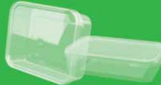
1500 ml Rectangular Container