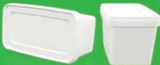
1150 ml Rectangular Container