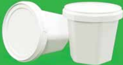
1000 ml Angular Bucket