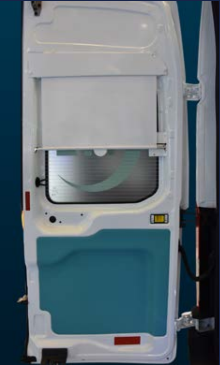
Door Interior Upholster