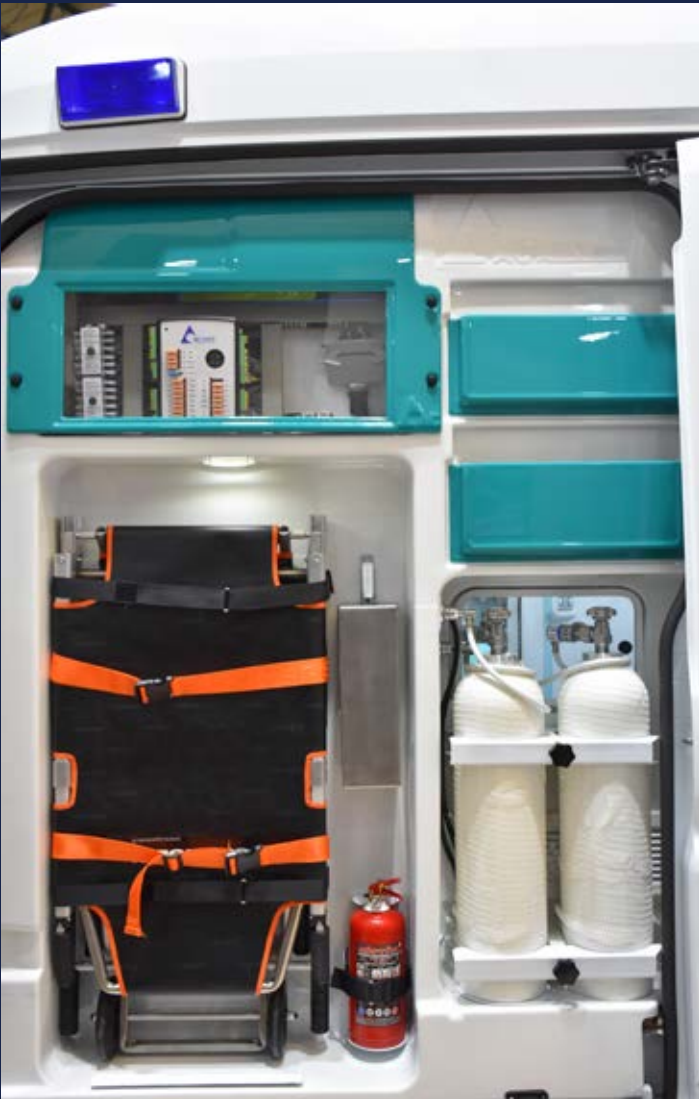
Interior of the Left Sliding Door