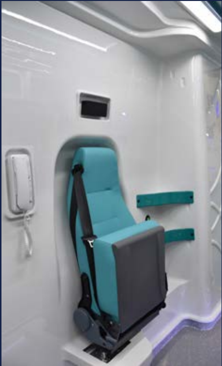
M1 Classified Seats