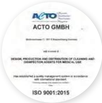
ISO 9001:2015 Quality Management System