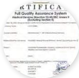
CE 93/42/EEC Full Quality Assurance System