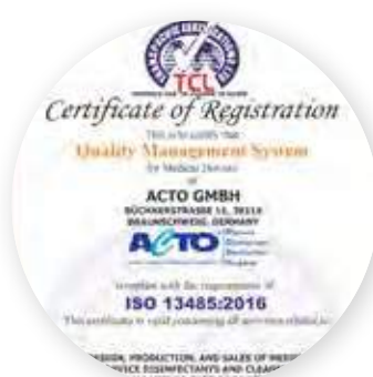
ISO 13485:2016 Quality Management System for Medical Device