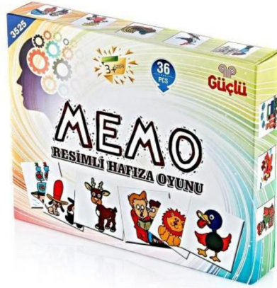
Picture Memory Game 36 Pcs