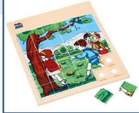
Pictured Puzzle 37 Pcs