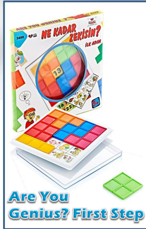
Are You Genius? First Step