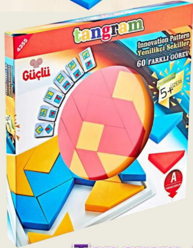
Tangram A Innovative Shapes