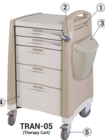
TRAN-05 (Therapy Cart)