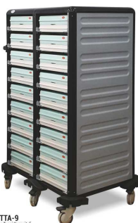
TTA-9 9x9 Termo Tepsi Kapasitesi 9x9 Thermo Trays Capacity