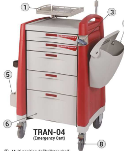
TRAN-04 (Emergency Cart)