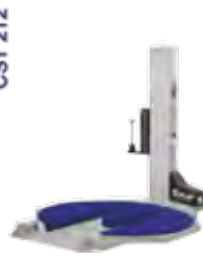
CST - TP Version