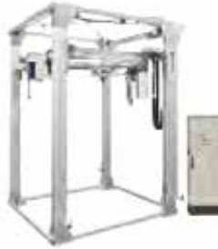
GL 2000 / GL 2000 twin