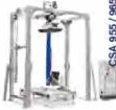
CSA 955 / 965