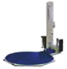
CST 212 Auto Advance