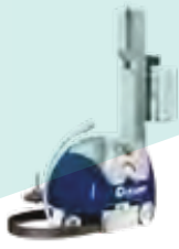
CSM 211 / 212 / 212 Advance