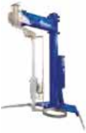
CSA 211 / 212 advance