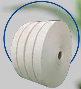
PE Coated Bottom Reels