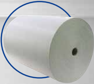
Uncoated Paper Rolls

With our capacity of 8000 tonnes per annum and most advanced machinery, we promise our customers the most extensive range of raw material prepared in the most hygienic and advanced environment.