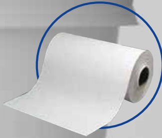
PE Coated Paper Reels