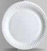
Paper Plate Fans