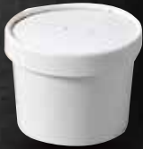
Paper Bowl Food Containers