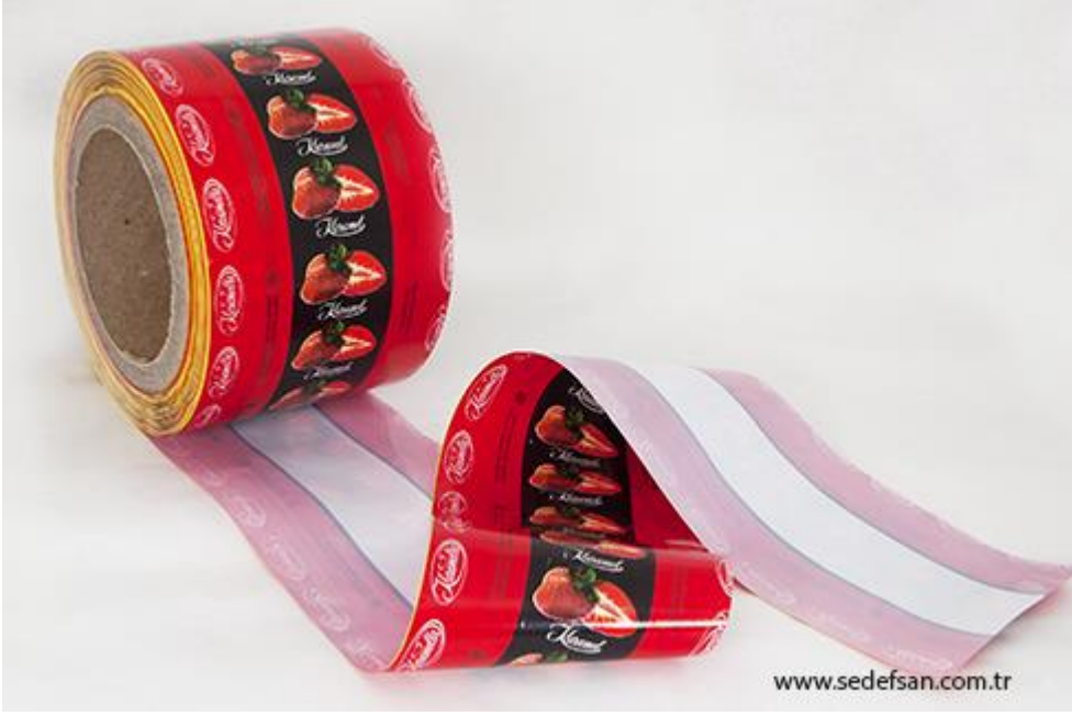
OPAGUE PET TWIST