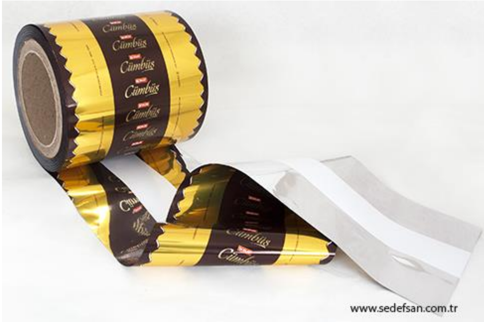
TWIST PET MET