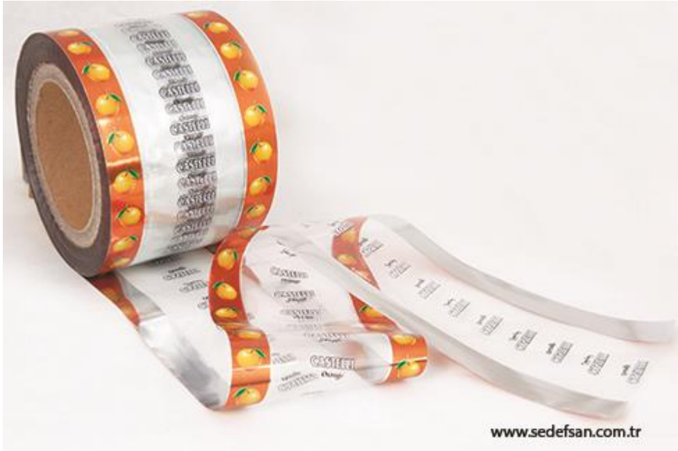
PET TRANSPARENT TWIST